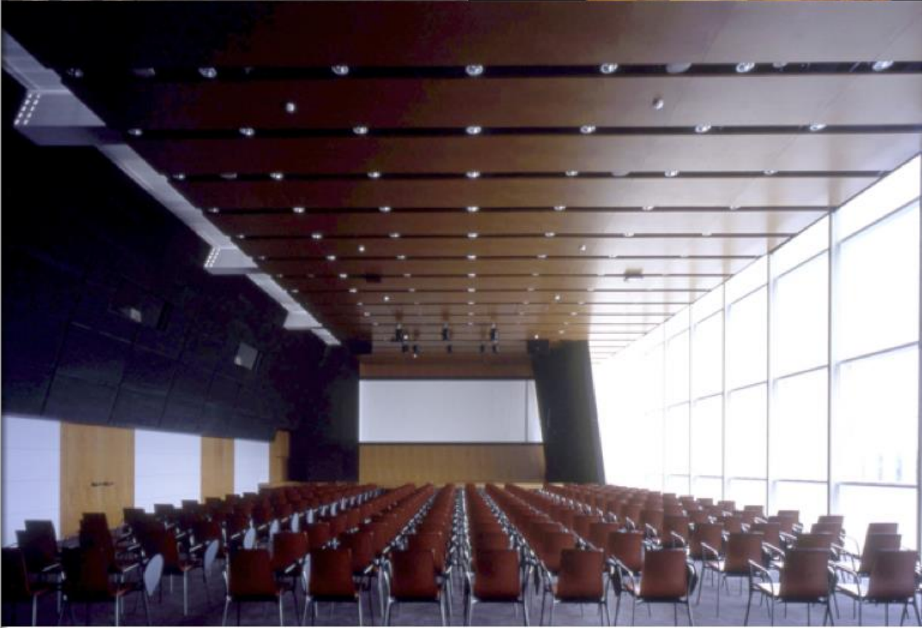
THE TAKEDA YOUNG ENTREPRENEURSHIP AWARD